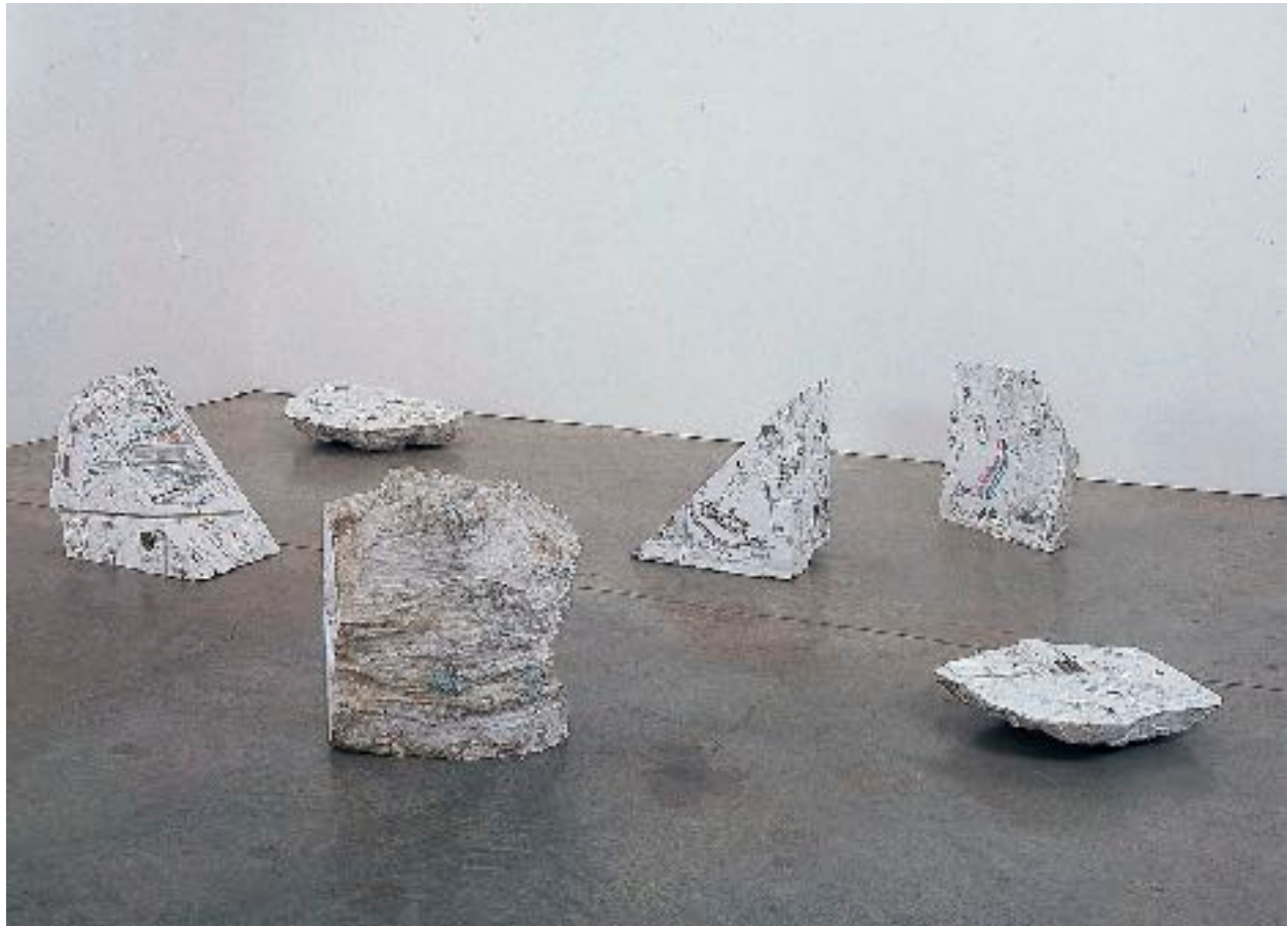
Roman Kitchen , 2005, 6 parts Polystyrene, Detritus, resin

born in Oakland, California, 1973; lives in London, UK and Berlin, Germany