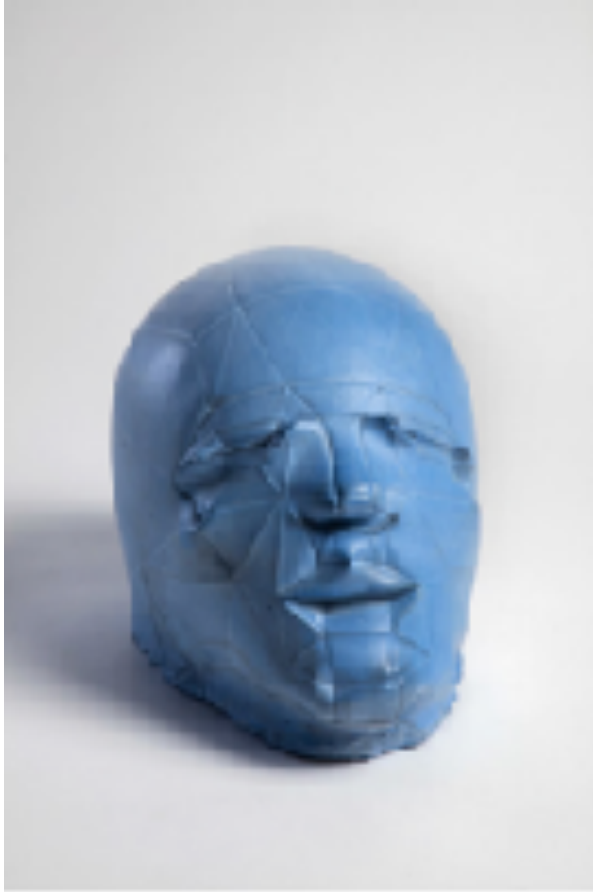
Jean-Luc Moulène; Iron Mask (Mexico City) , 2017, synthetic concrete (Rokam)