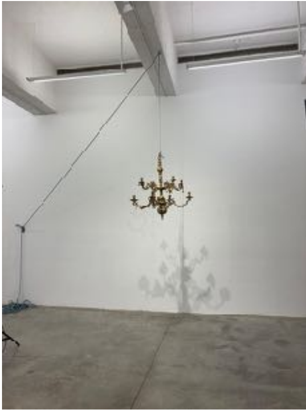
A Chandelier into a Chandelier (Un candelabro en un candelabro), 2023, brass chandelier that was cast, melted, and recast into its own mold 33 x 34 x 34 inches

born in Mexico City, Mexico in 1979 ; lives in Mexico City