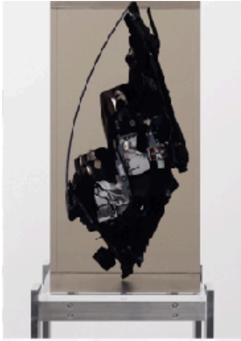
Seer: Peering though Aurora, 2020

born in Detroit, Michigan, 1989; lives in Detroit, Michigan