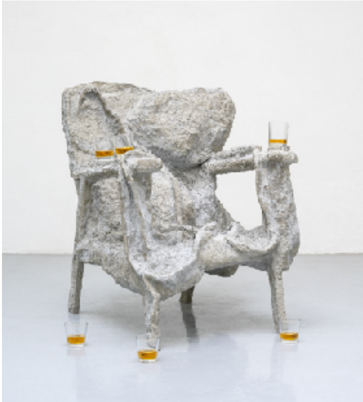
Dusk Slug IV , 2021

born in London, 1986; lives in Vienna and London