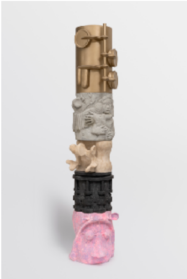
Achronie 37, 2017 colored resin, cement, and plaster 48 to 84 inches; 122 x 213 1/4 cm

born 1983, Nantes, France; lives in Paris