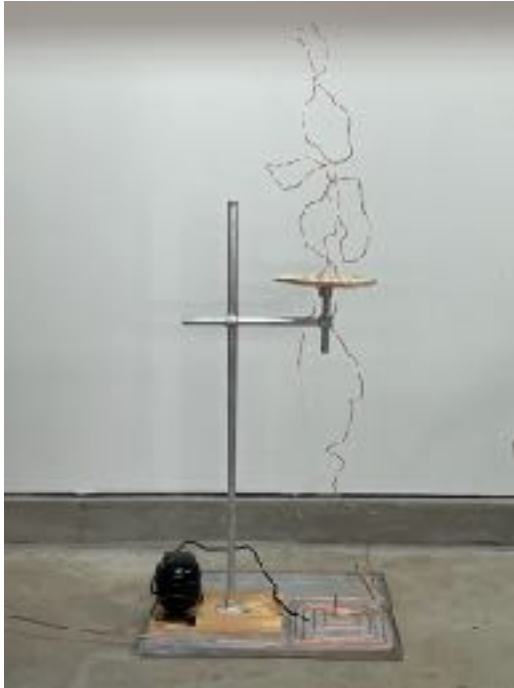
Thermal Fountain , 2024 refrigerator compressor

born in Arlington, Virginia in 1977; lives in Brooklyn, New York