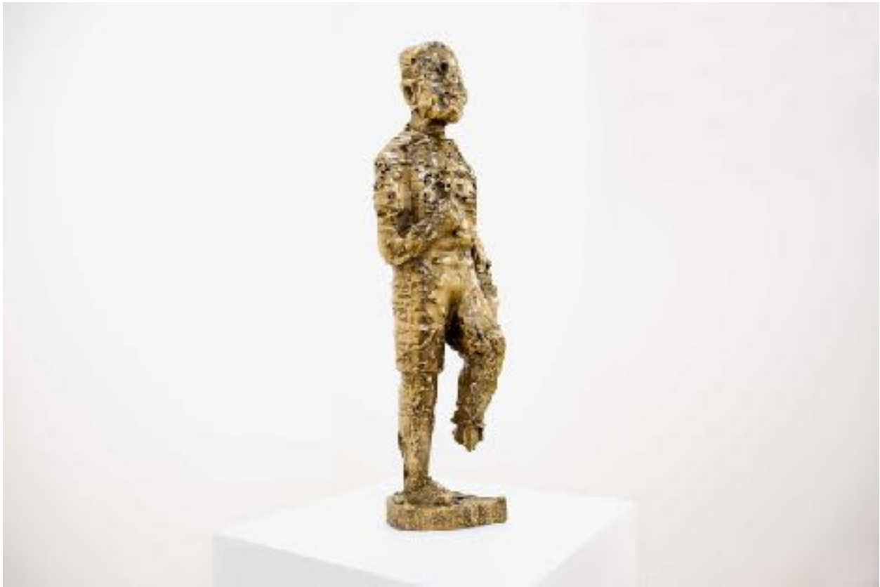
BAM (for Michael) , 2016 bronze 19 x 5 x 5 inches

born in 1970, Los Angeles, California; lives in New York, New York