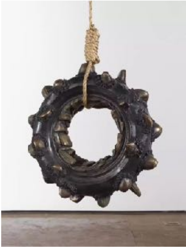
Swing Low , 2015 bronze, rope

born in St. Andrew, Jamaica in 1963; lives in New York, New York