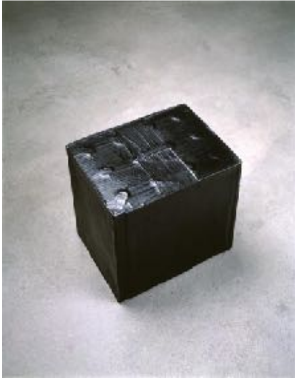
Black Box , 2005 (FW-0213) hand-painted bronze, cast, ed. 3/3) 11 3/4 x 9 1/2 x 12 1/4 inches Private Collection

born in Ilford, Essex, United Kingdom in 1963; lives in London, United Kingdom