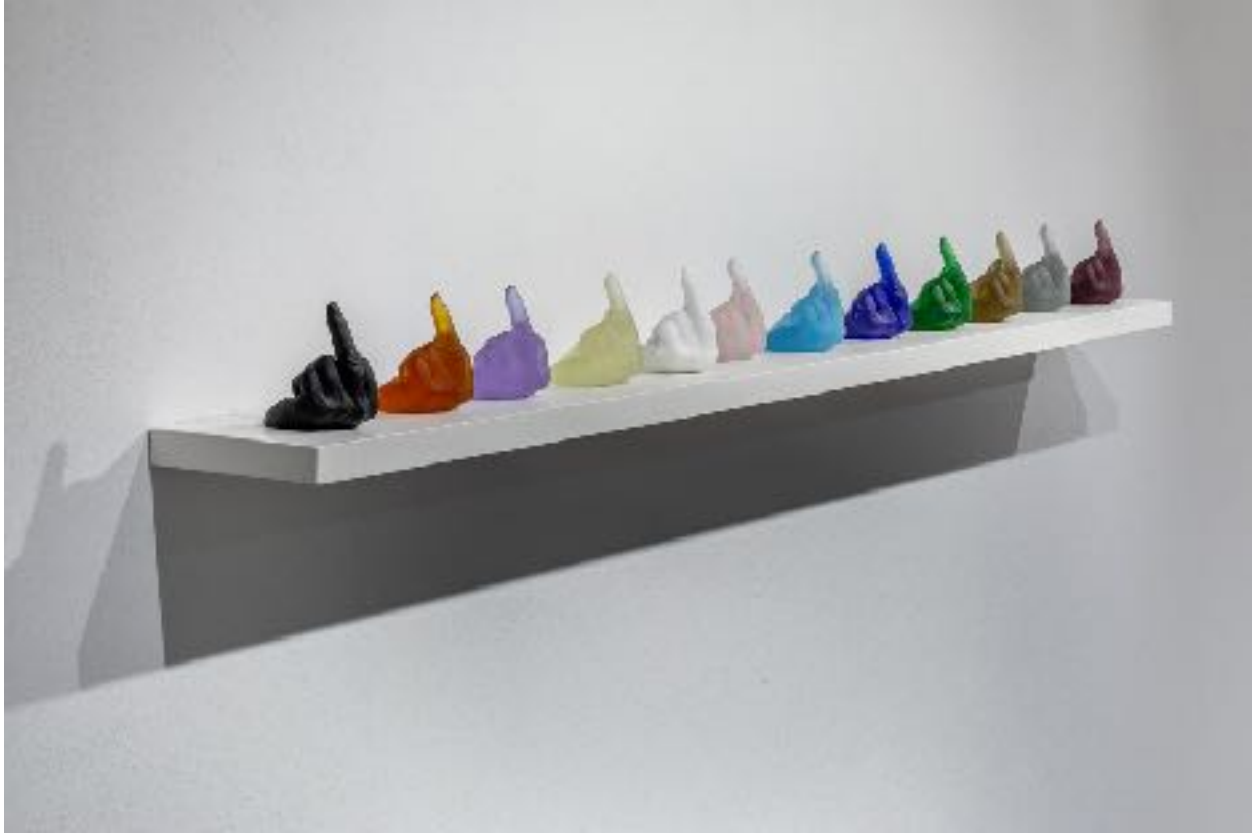
Study of Perspective in Glass, 2018

born in Beijing, China, 1957; lives in Berlin, Germany