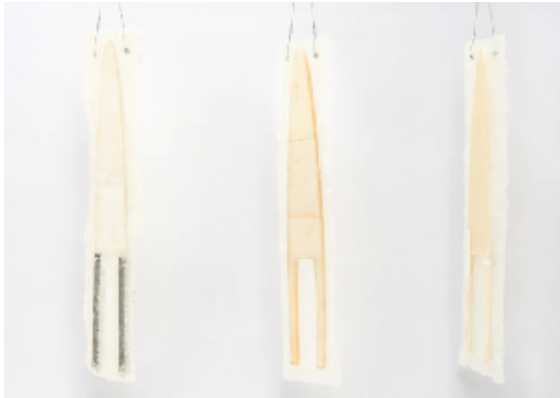
Fresh Artifacts , 2017

born in Tuktoyaktuk, Northwest Territories, Canada in 1963; lives in Tuktoyaktuk, Northwest Territories, Canada