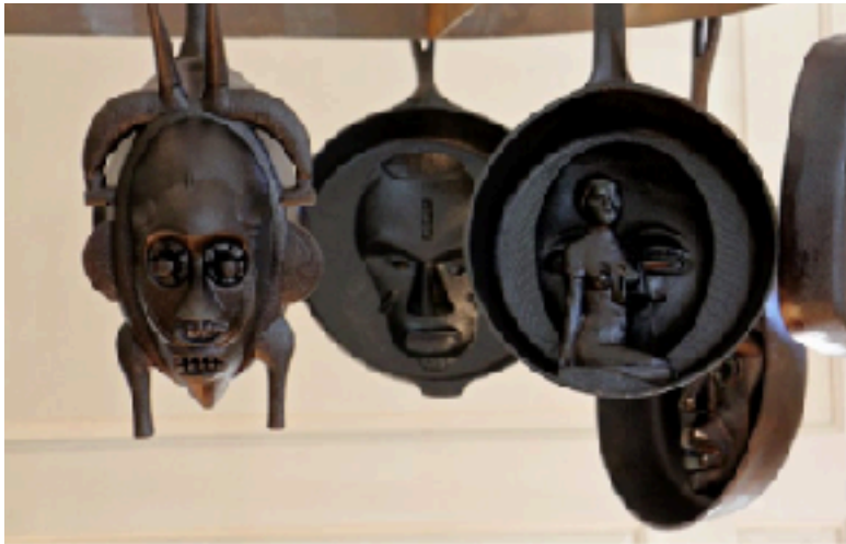
cast by hand iron, 2020

born in Dallas, Texas, 1983; lives in New York, New York